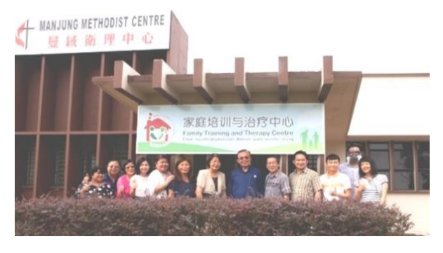
Oasis Manjung 1st batch of FLE level 1 course

We have also dealt with 30 plus counselling cases at our Centre. People are increasingly seeking help online, especially those from other towns in Malaysia and countries like China, Singapore, Indonesia, and Japan.